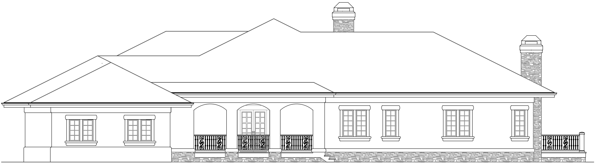
SONOMA, RIGHT ELEVATION, FACING