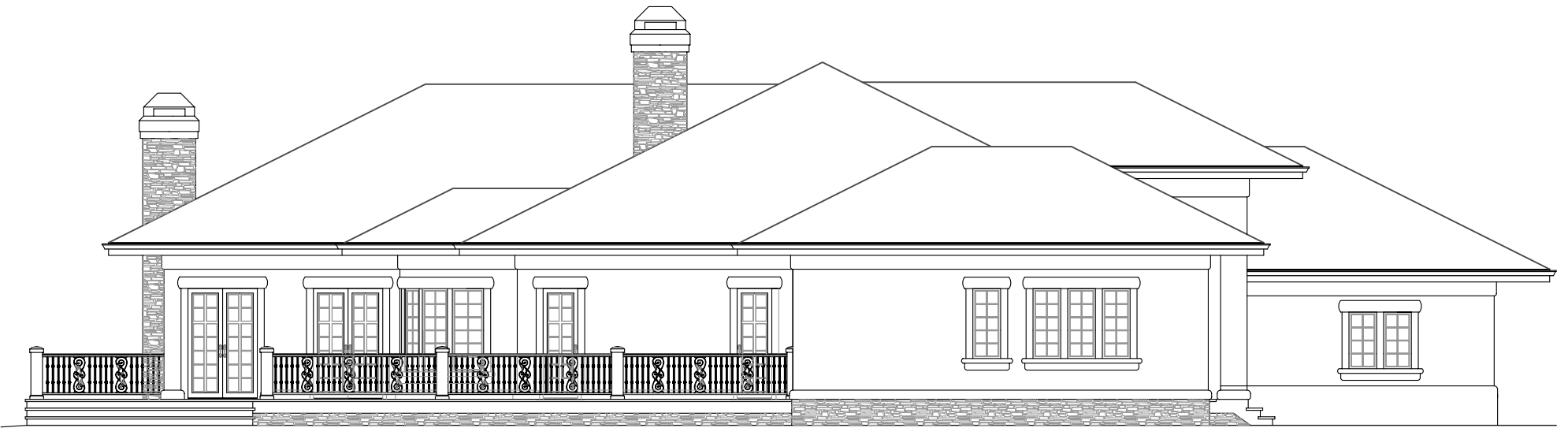
SONOMA, LEFT ELEVATION, FACING