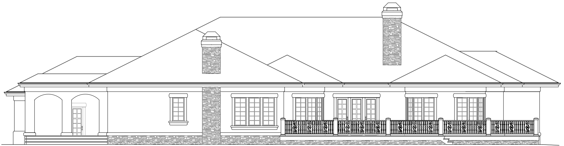
SONOMA, REAR ELEVATION