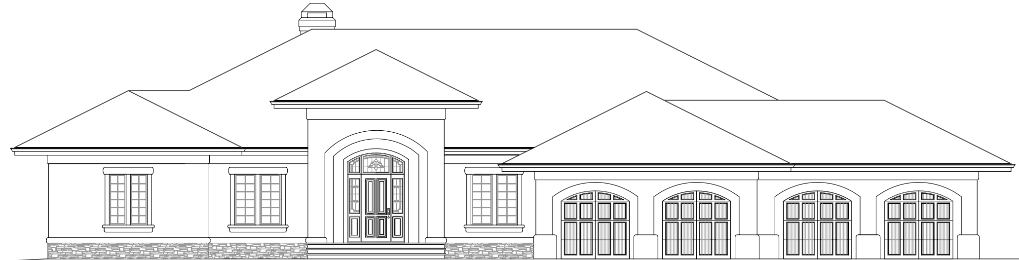
SONOMA, FRONT ELEVATION