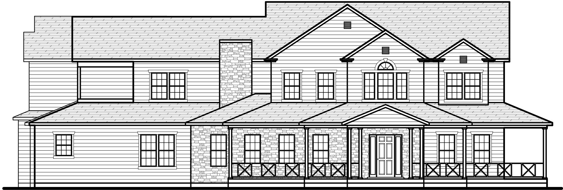
PORTOLA - FRONT ELEVATION