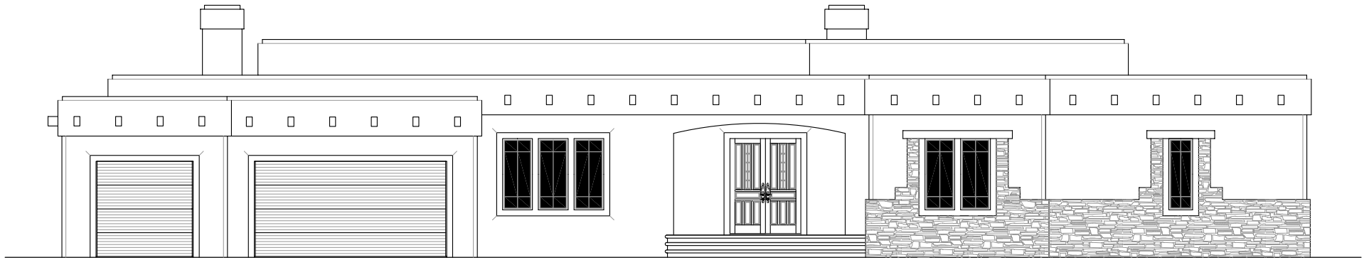
MESA VERDE, FRONT ELEVATION