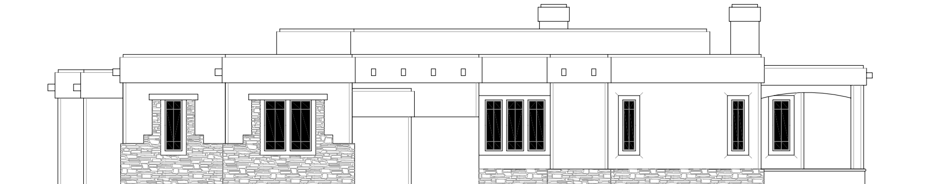
MESA VERDE, RIGHT ELEVATION, FACING