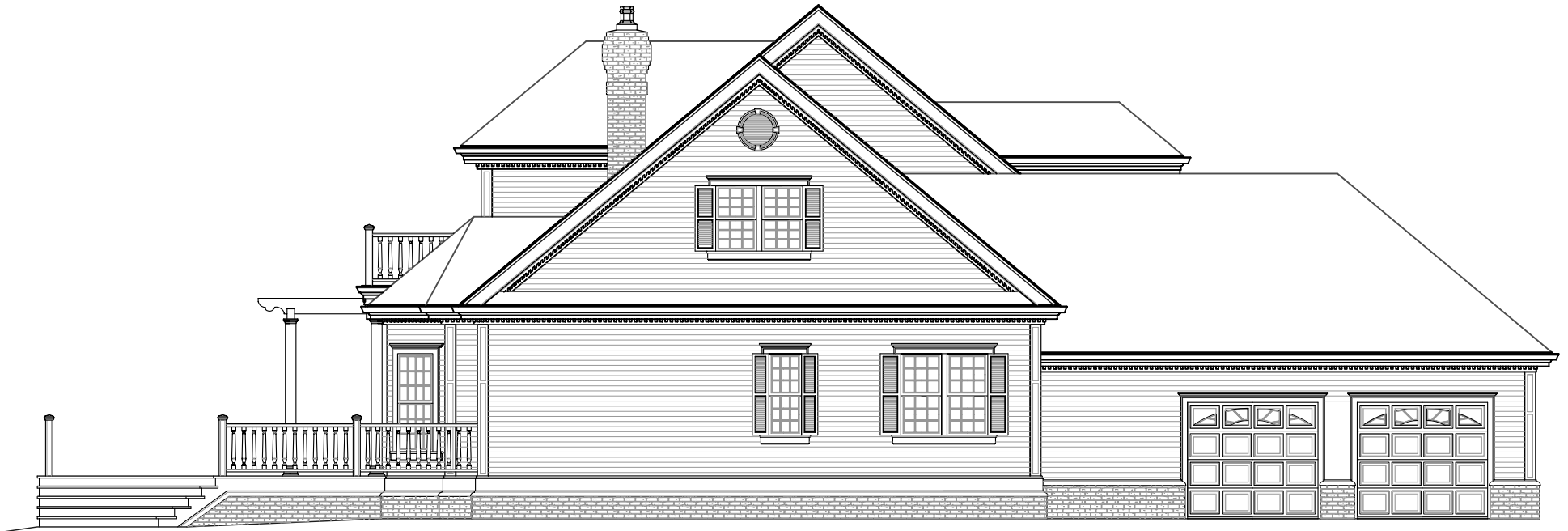
GLENSMEADE, LEFT ELEVATION, FACING