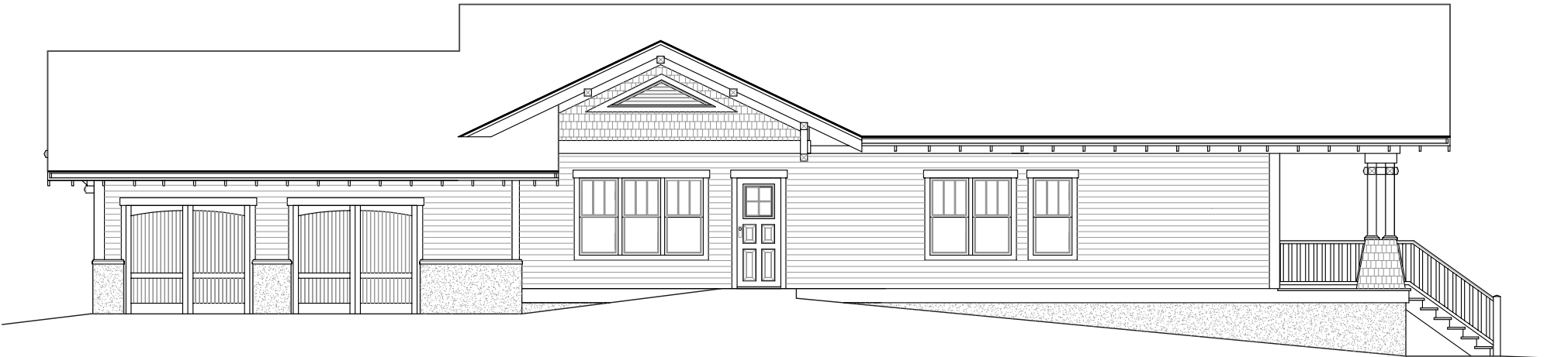
LANNING 3, LEFT ELEVATION, FACING