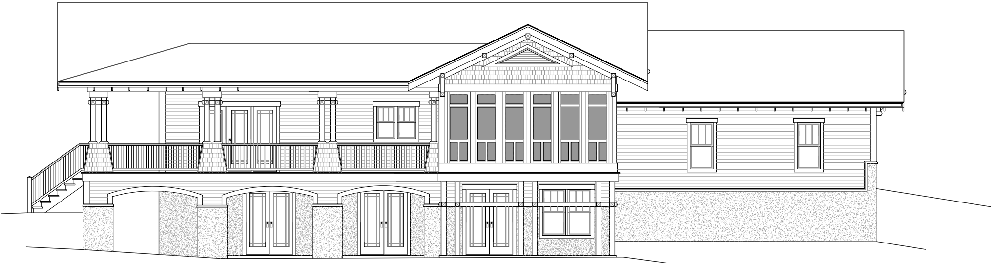
LANNING 3, RIGHT ELEVATION, FACING